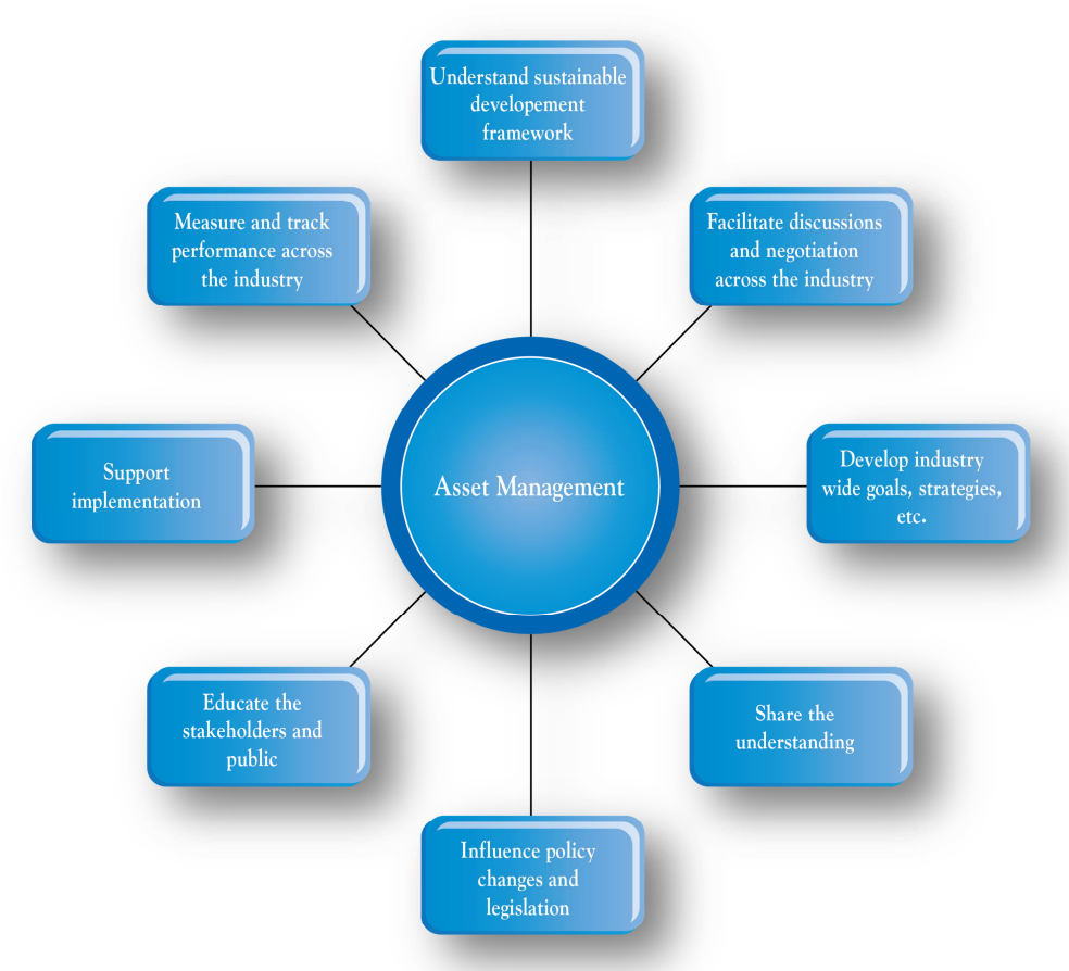
Figure 1: Asset Management Implementation Framework

Transportation Asset Management involves the collection and integration of multiple practices into a coherent and managed whole, the establishment of new approaches to asset management problems, and the linkage of business process to measures of the agency's mission and goals. Figure 1 <sup>8</sup> (adapted and modified) illustrates one such example where the asset management implementation framework consists of a collection of practices and business processes.