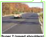
Super 2 (paved shoulders)