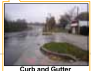
Curb and Gutter